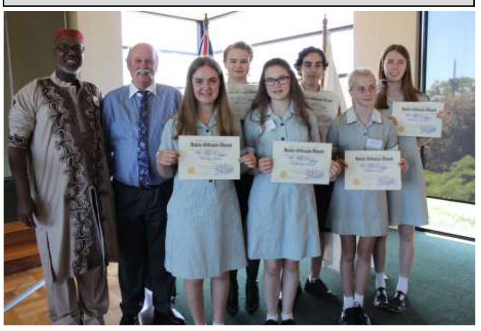
Congratulations to the six students who are the recipients of the 2015 Greensborough Rotary's Gillespie-Upton Awards.

THURSDAY 3RD DECEMBER, 2015 6.30pm-8.00pm